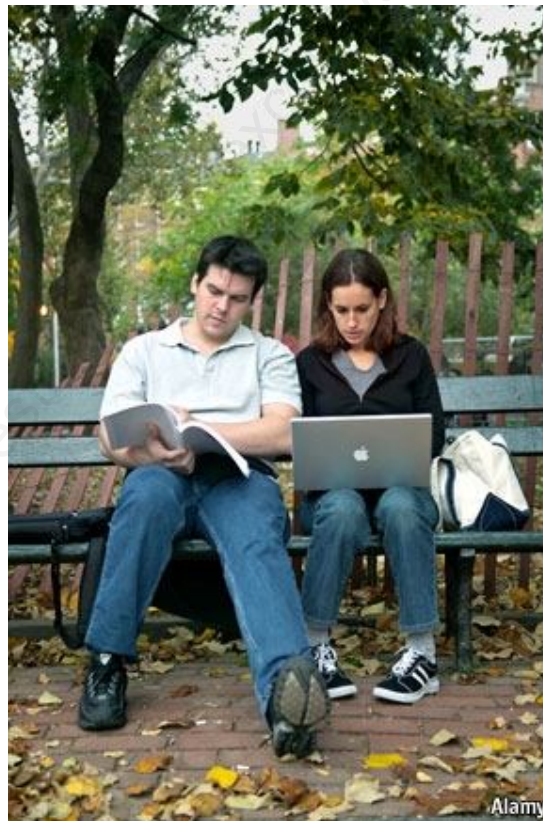
Running the numbers

To see how efficient higher education can be, look at the new online Western Governors University (WGU). Tuition costs less than $6,000 a year, compared with around $54,000 at Harvard. Students can study and take their exams when they want, not when the sabbaticals, holidays and scheduling of teaching staff allow. The average time to completion is just two-and-a-half years.