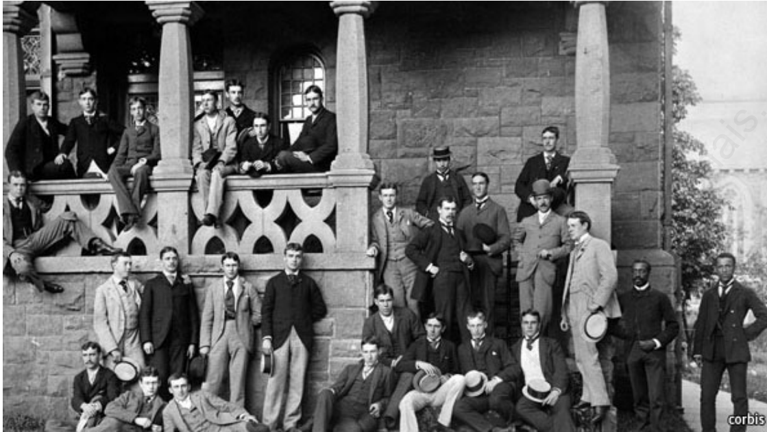
Running the numbers

American universities represent declining value for money to their students