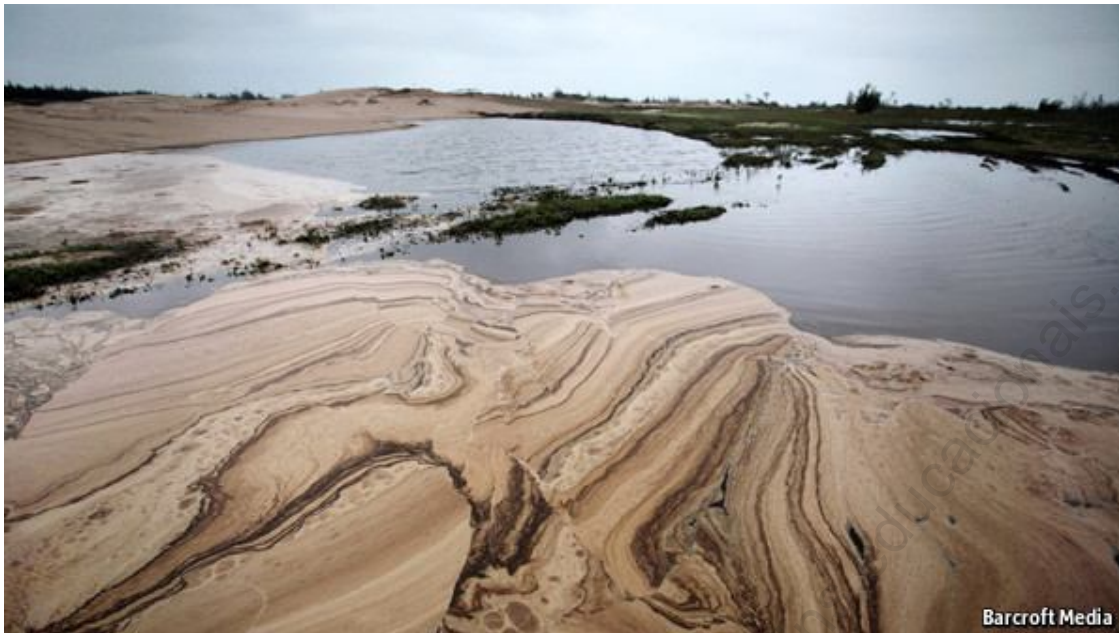
Don't drink the water; don't even touch the water

Severe though China's problems with water, soil and air are, they are not different in kind from those of other nations in the past. As Pan Jiahua of the Chinese Academy of Social Sciences (CASS) puts it, "We're following the US, Japan and UK and because of inertia we don't have the capacity to stop quickly."