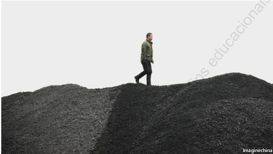
He can see the future and it's black

Dirty coal will remain China's most important fuel for the foreseeable future (hopes of a shale-gas revolution may be constrained by water shortages). Coal is cheaper and, as Nat Bullard of Bloomberg New Energy Finance, a firm of market analysts, points out, it provides “baseload power”—continuous energy unaffected by a lack of sun or wind. Its cost advantages will shrink, though. China is the world's lowest-cost producer of solar panels. Mr Bullard says solar power should become competitive without subsidies by 2020.